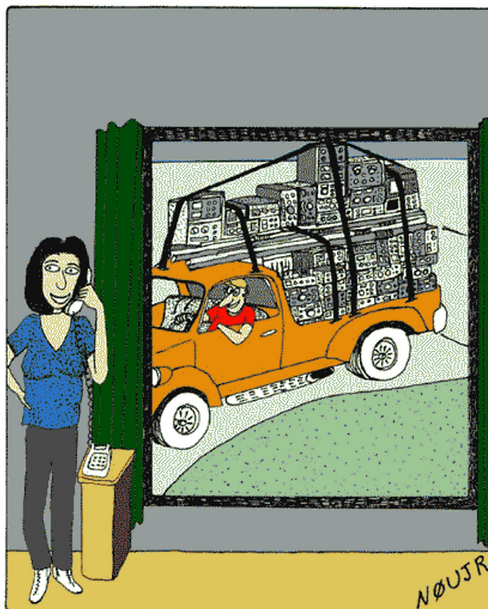
"No Greg went to the ham auction this afternoon, to get rid of a couple old radios that were cluttering up the place...Oh I think I hear him pulling in now!"