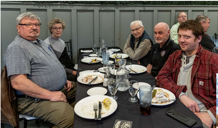
A few of the satisfied SPRC banquet attendees after enjoying a fine meal.