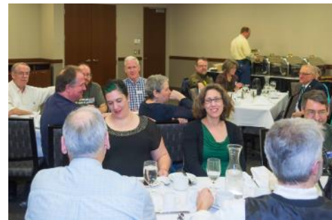
Some of the members and guests enjoying dinner and conversation.