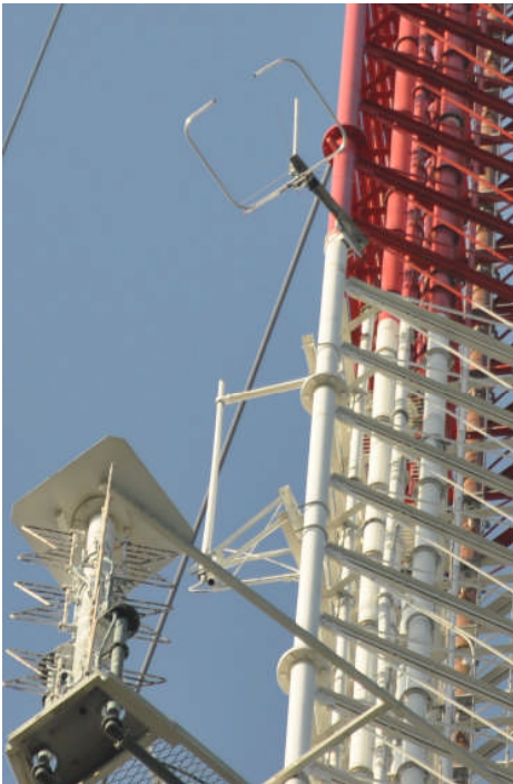
Looking from the transmitter building with the top of the Ch. 9 standby antenna at the bottom.